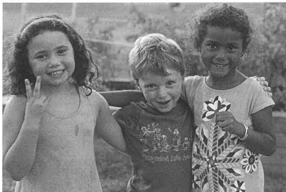
Kindergarten students playing at the IAA Open House on Tuesday evening